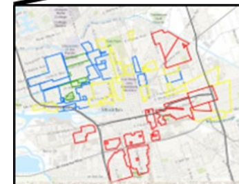
Formerly redlined neighborhoods in Stockton