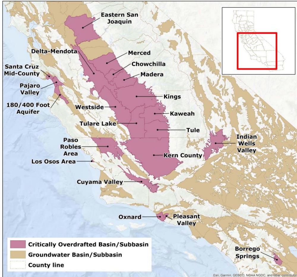
Map created from B118 Groundwater Basin Boundaries Published 02/11/2019. This map published 01/2020.