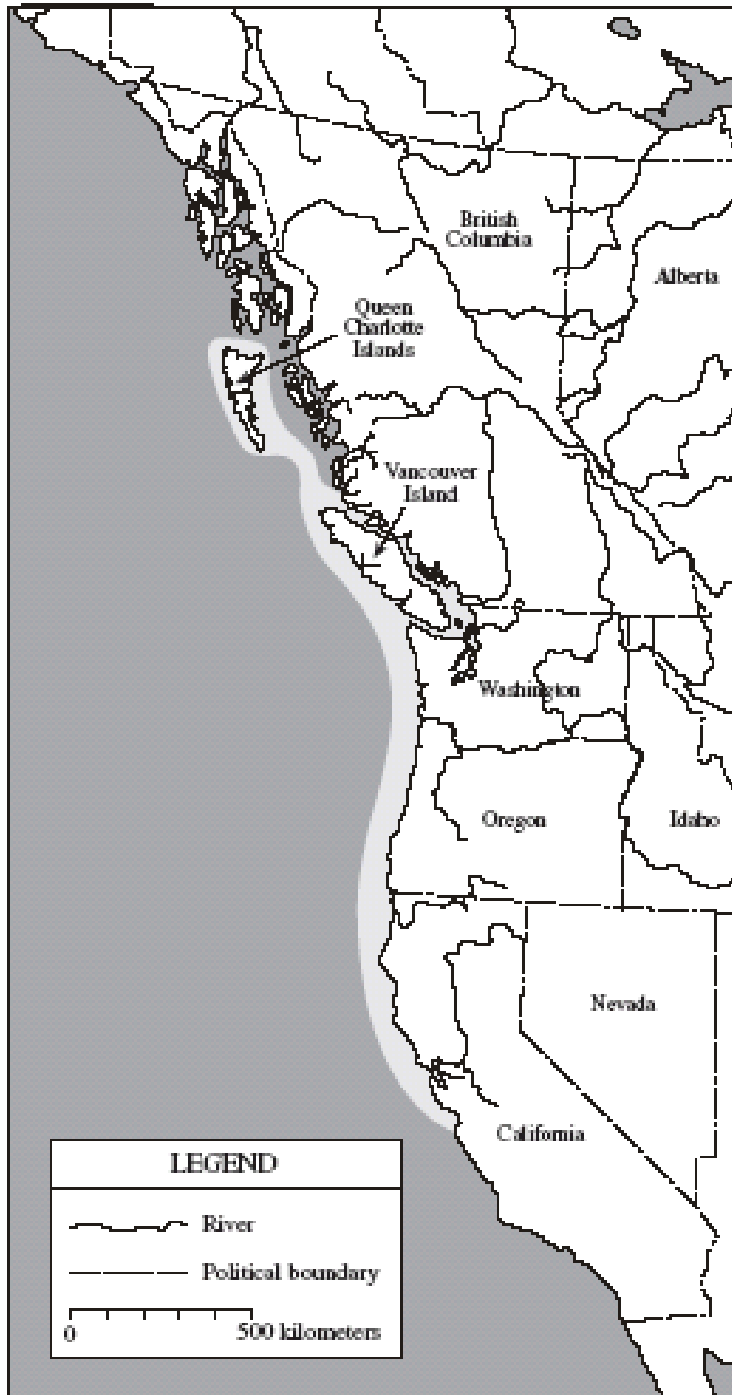
Figure 11-2. Range of the Southern Resident killer whale (Wiles 2004)

The Center for Whale Research completed their 2022 annual census for NMFS on July 1, 2022, and reported the southern resident killer whale population at 73 individuals: with J pod at 25 individuals, K pod at 16, and L pod at 32 (Center for Whale Research 2022). This is a decrease from 74 individuals since the last census completed July 1, 2021. The southern resident killer whale population has not been this low since 1984.