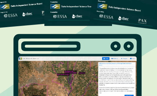
Three reports and an online monitoring inventory database to explore results