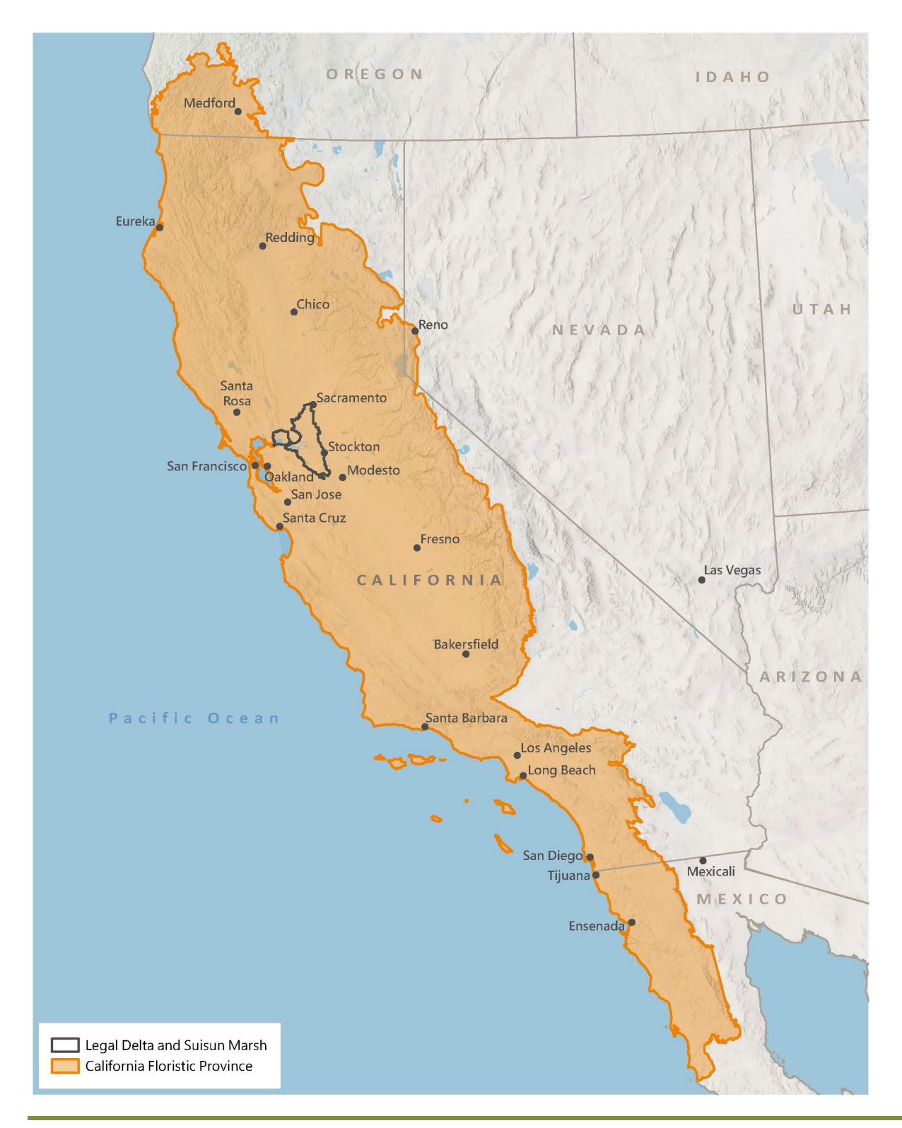
Figure 2. California Floristic Province

This map illustrates the extent of the California Floristic Province along the West Coast of the United States, which ranges from southern Oregon to northwestern Mexico, and east to the Sierra Nevada mountains. The Delta and Suisun Marsh are fully within the California Floristic Province.