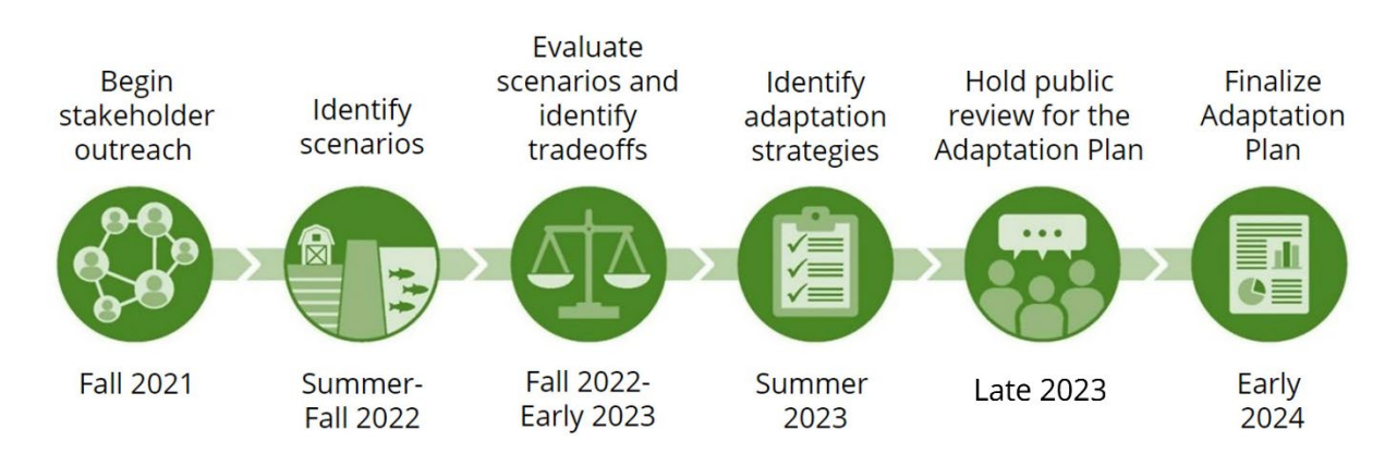
Figure 1: Adaptation Process and Timeline

input on draft strategies from the four technical focus groups and the SWG; releasing a draft Adaptation Plan (expected in late 2023); and finalizing the Adaptation Plan in early 2024, following a public comment period. Figure 1 shows the adaptation planning process and timeline.