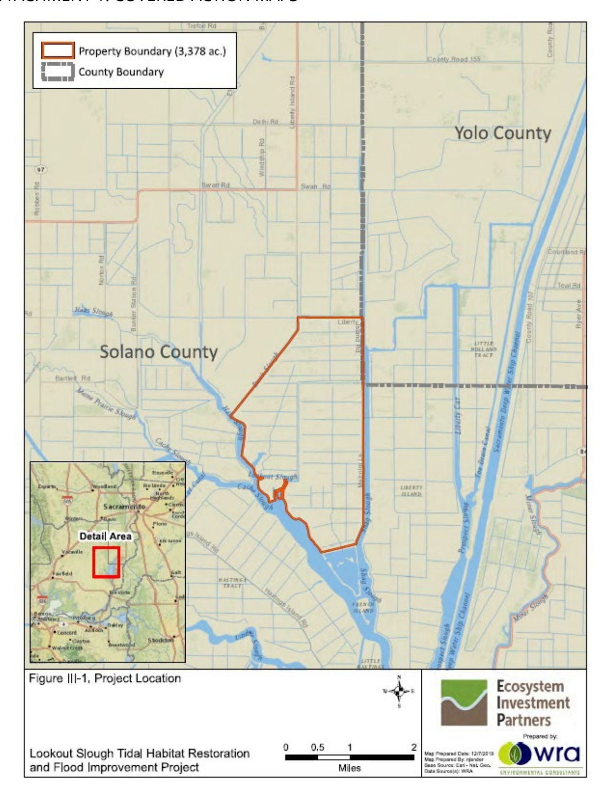
Figure 1. Location (<u>Draft EIR, Certification Record LOS.4.00001</u>, p. III-4)