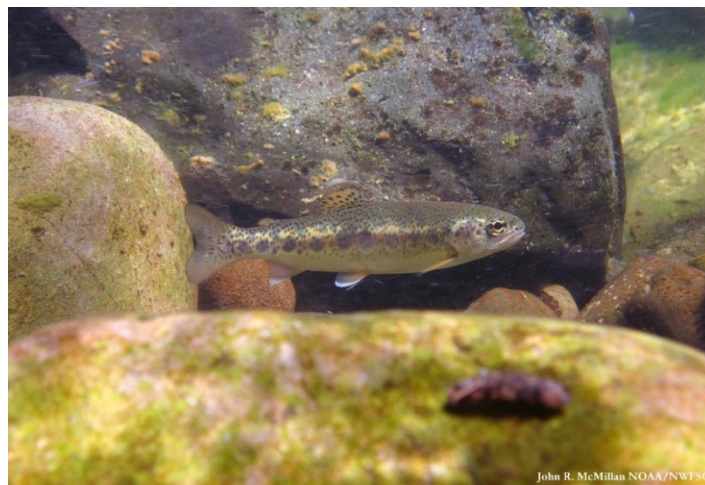
Figure 2. Image of juvenile steelhead provided by John R. McMillan NOAA/NWFSC .

The Endangered Species Act 5-year Status Review for California Central Valley Steelhead available at the NOAA Fisheries Publications web page .