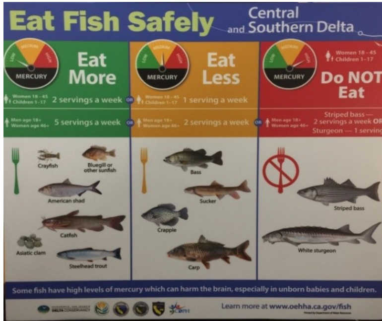
Figure 2-1 Example of Fish Consumption Advisory Posted at California State Lands Commission Lease Locations

In 2012, CSLC staff identified approximately 54 leases that could be candidates for the posting of advisory signs. Of these 54 leases, a 2017 review identified 19 priority locations that were found to be potentially viable for the first year of the posting effort. CSLC staff compiled information on those lease locations into a list and shared the information with CDPH, who incorporated the information into their posting database. On February 14, 2017, letters were sent to these locations requesting permission to post an advisory sign onsite. Although the goal was to post 19 signs, 12 planned locations either were not viable, the land owner did not approve the sign posting, or the signs were posted by other agencies because of miscommunication with CDPH. As listed in Table 2-1, seven signs have been posted to date. Figure 2-2 provides a map of the locations. Photographs are provided in Figures 2-3 through 2-7.