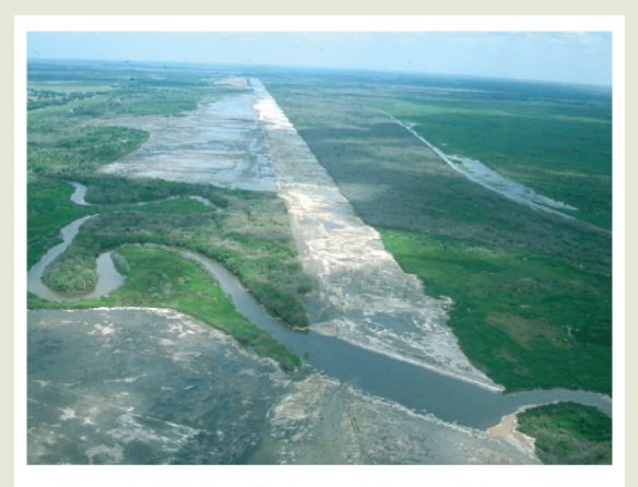
February 9, 2001, photo of implemented phase one Kissimmee River Restoration Project showing the backfilled canal, degraded soil area, remnant river channel, the connector channel, and wetland areas.

These results suggest that after construction is complete in 2014, and hydrologic conditions are fully restored in 2015, the region is on track to achieve its goal of restored ecological integrity in the Kissimmee River and its floodplain. In the 1960s, the Kissimmee River, located in south-central Florida, was channelized for floodcontrol purposes (Toth et al. 1998). In the 1990s, planning began for a 15-year restoration project. The restoration design included 70 kilometers of river channel and 104 square kilometers of floodplain—the largest attempted river restoration project in the world (Dahm et al. 1995). Adaptive research, monitoring, and evaluation programs were developed to provide a scientific foundation for fine-tuning each phase of the restoration effort (Toth et al. 1998). To "model linkages between objectives and proposed action(s)," conceptual models were developed to anticipate the restored Kissimmee River ecosystem, predict patterns of response for abiotic and biotic variables, and consider methods and performance measures for evaluating progress toward restoration in the river basin (Dahm et al. 1995).