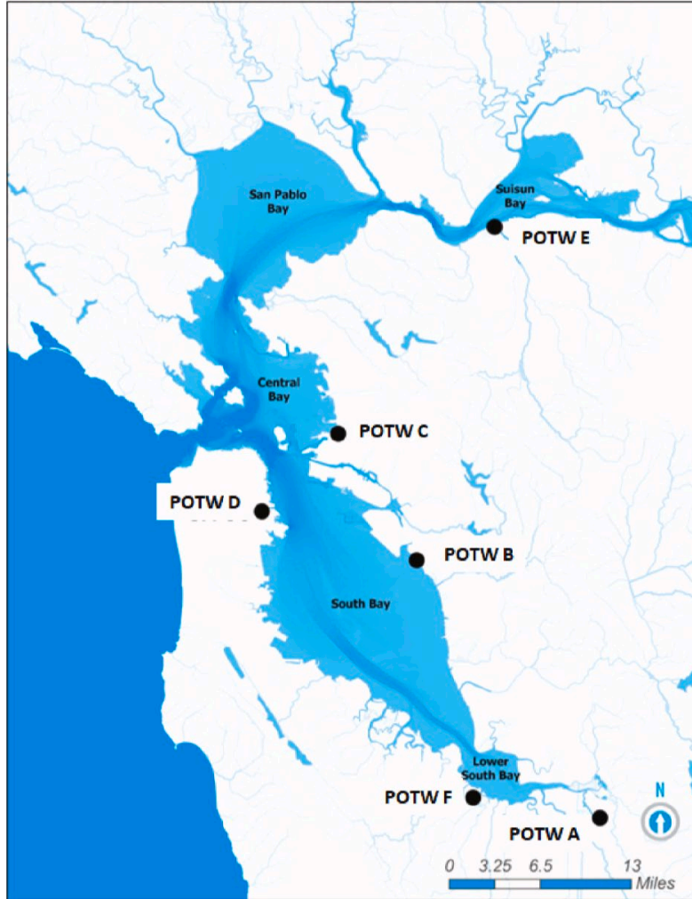
Map of San Francisco Bay municipal wastewater discharge locations sampled during this study